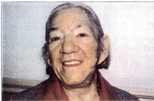
Figure 3. Postop — frontal view.